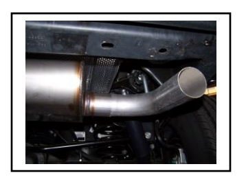
5b. Use clamp #E to secure to the exit pipe. Do not tighten.